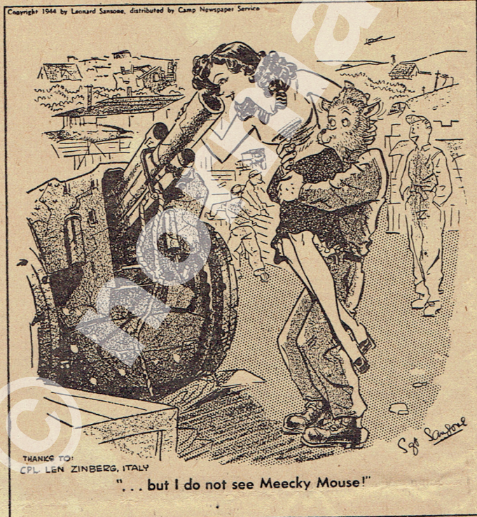
Mat 109-670—Stencil 110)